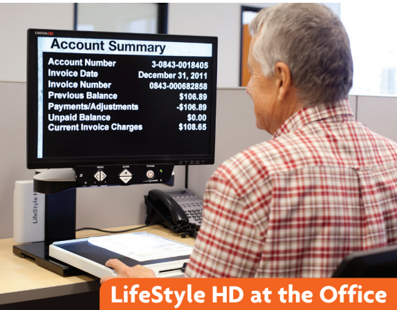
LifeStyle HD at the Office