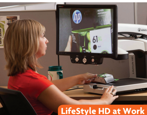
LifeStyle HD at Work