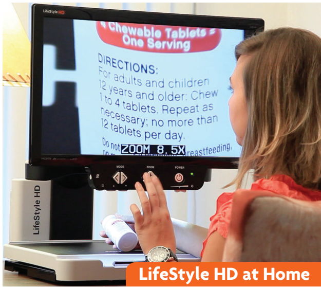
LifeStyle HD at Home